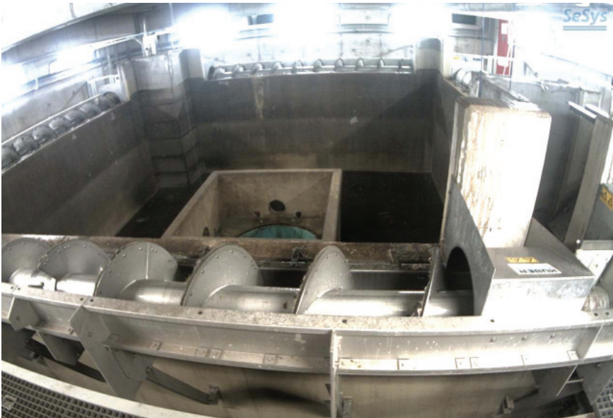
Typical camera image - pumps within a storm drain