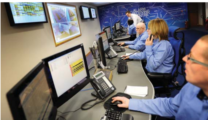
Multiple cameras can be displayed simultaneously on a PC or a monitor wall with free of charge control station software.